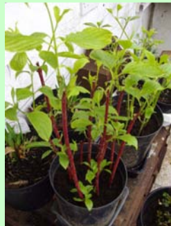
< ^ Stick in the Mud Prunings and cuttings are a cheap method for increasing your plant stock

This is a relatively cheap method for acquiring new plants from existing stock (so you know that it will be identical to the mother-plant) and, depending on the time of year you take cuttings and from where on the plant, you will enjoy a very high success rate.