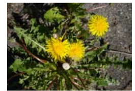
< Killer on the Loose Glyphosate may not be the wonder weedkiller we think it is

As a systemic weedkiller, Glyphosate (N-phosphonomethyl glycine) was designed to be taken up by weeds through their leaves and stems and translocated to growing points through the inhibition of key growing enzymes. However, it is emerging that Glyphosate , a popular and widely-available weedkiller (RoundUp, Weedol Rootkill Plus, Resolva 24H) has been linked to Sudden Death Syndrome in many fields treated with RoundUp in the US.