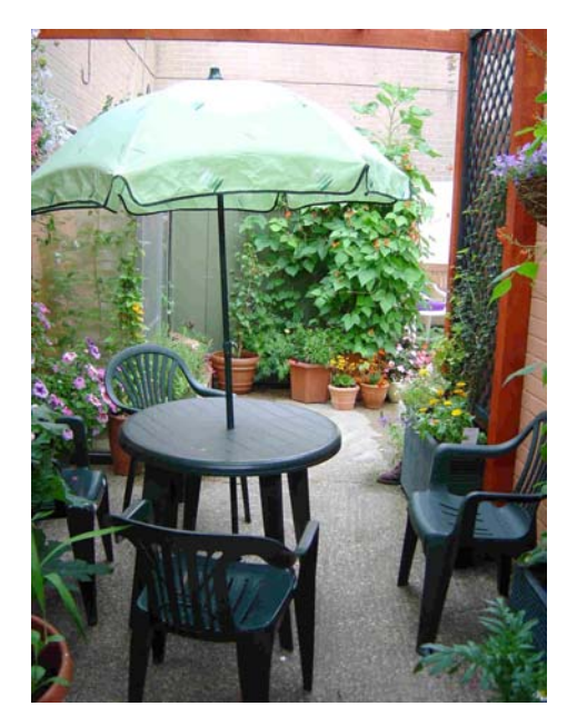
A place to sit and chat under the multicoloured pergola

A wooden pergola also softened the harshness of materials and was painted in a green and red colour