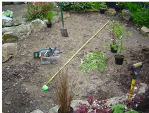
^ BEFORE: the lawn removed, area levelled and prepared for slabs. Purbeck stones were resited.

The finished effect is of an informal, unfussy and irregular upper patio area that aims to accentuate the attractive design of the pre-existing rockery outcrops. Maintenance time is dramatically reduced to occasional weeding of seedlings that have grown in the shingle gaps.