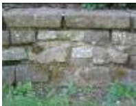
^ An existing Purbeck stone wall in the upper garden gave me the inspiration to use serpentine drystone walls